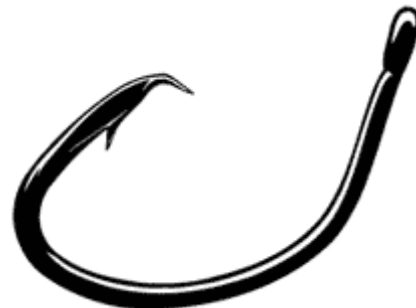
Figure 2 Circle hook