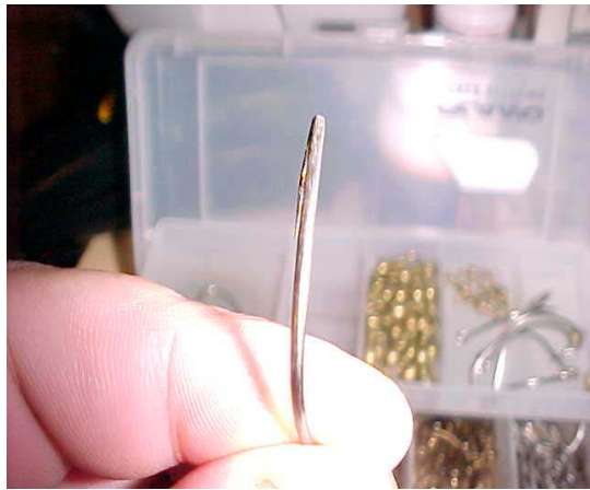
Figure 3 Hook with no offset angle